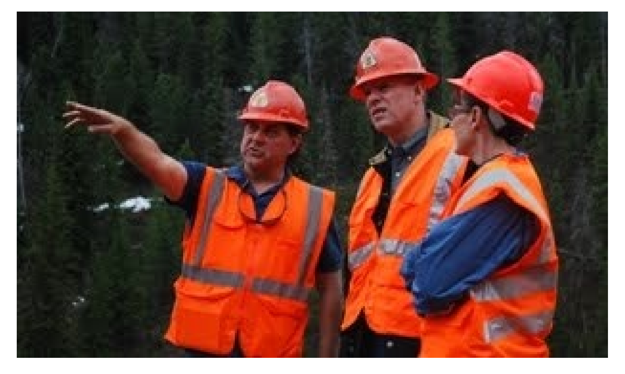
"Open the road as quickly and as safely as possible."